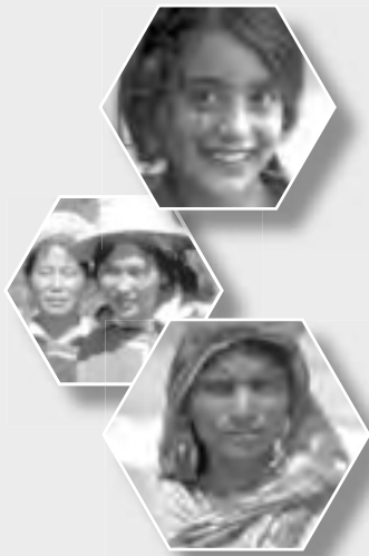
7. Top 25 most responsive majority Buddhist peoples over 10,000 in population with no scriptures and little access to water, mid-2005.