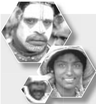
List 4. Top 25 most responsive peoples over 10,000 in population, mid-2005